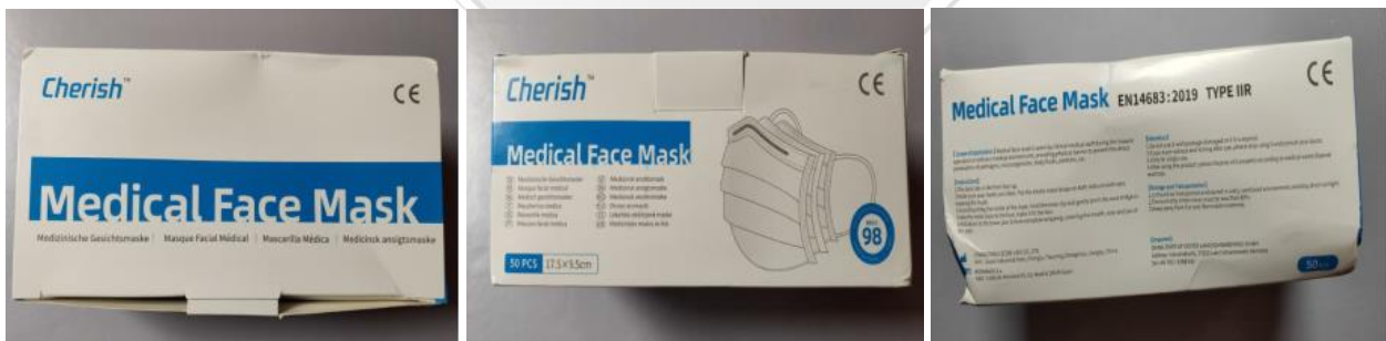
Photo of Samples

Note: Pass = Meet customer requirements; Fail = Fail customer requirements; # = No comment; N.D. = Not detected.