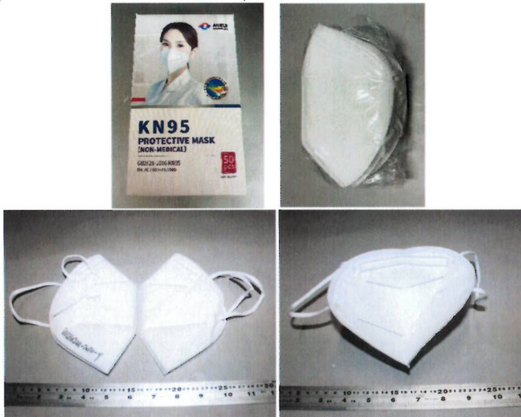
CASST specimen number WLH0241-2020-09

Anhui Zhongnan Air Dedence Works Protective Co., Ltd.'s model ZN9501 KN95 Protective Mask (Non-Medical)